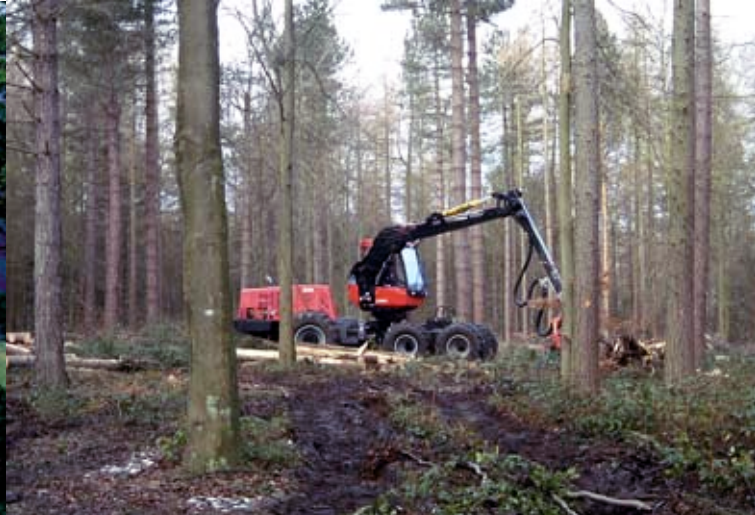
Forestry provides valuable income

The Hovingham Estate includes tracts of arable and grazed farmland, forestry, woodland, parkland, watercourses and buildings of traditional style (including many of those in the village itself). The Worsley family place great importance on the custodianship of both the Hall and the land with which it is associated, sensitively balancing productivity, habitat management and landscape and building conservation.