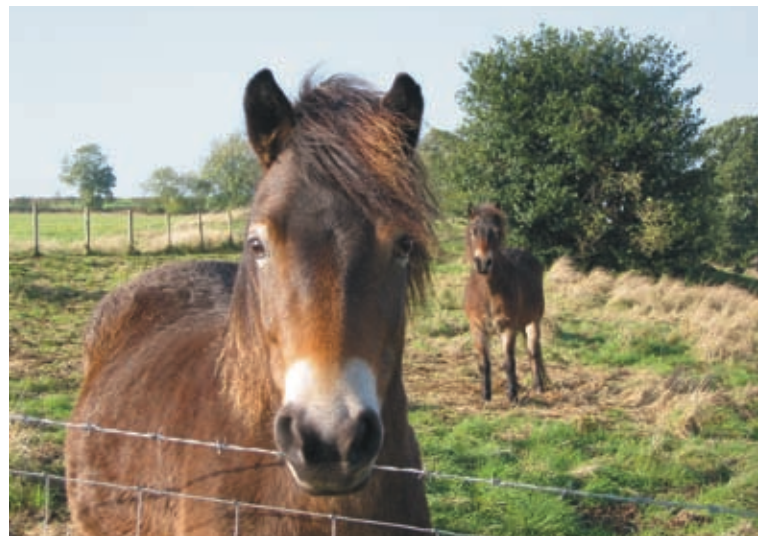
Exmoor ponies grazing Cawton Bank

Cawton Bank is not yet of SINC quality. It was once part of a larger grazed field. When the rest of the field was ploughed to create arable land, this steep bank was isolated as an island, deemed to be of little use for agriculture. Since 2003 it has been seasonally grazed by Exmoor ponies, the aim being to reduce the nutrients and develop a more diverse range of flora.