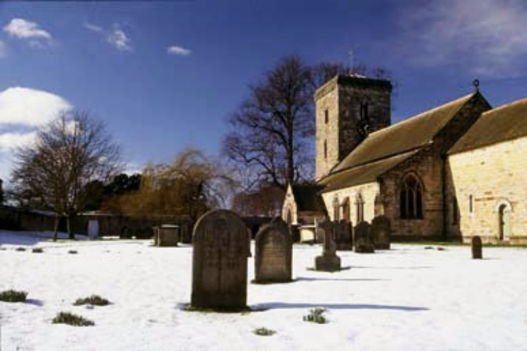
The Church of All Saints, Hovingham