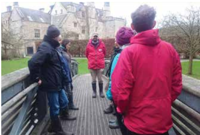
Heritage Lottery Fund visit to evaluate the RYEvitalise project bid, Nunnington