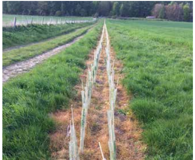
Hedge planting, Coneysthorpe