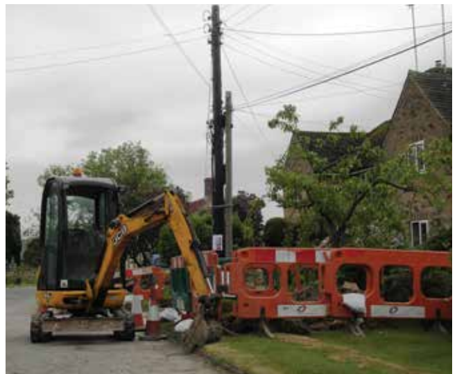
Undergrounding overhead electricity lines, Crambe (during)