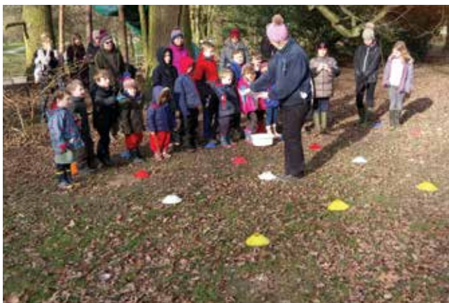
Learning orienteering at a Junior Ranger Club day, Yorkshire Arboretum