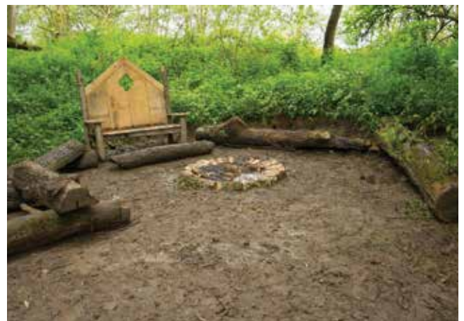
New 'Forest Schools' area, Howsham Mill