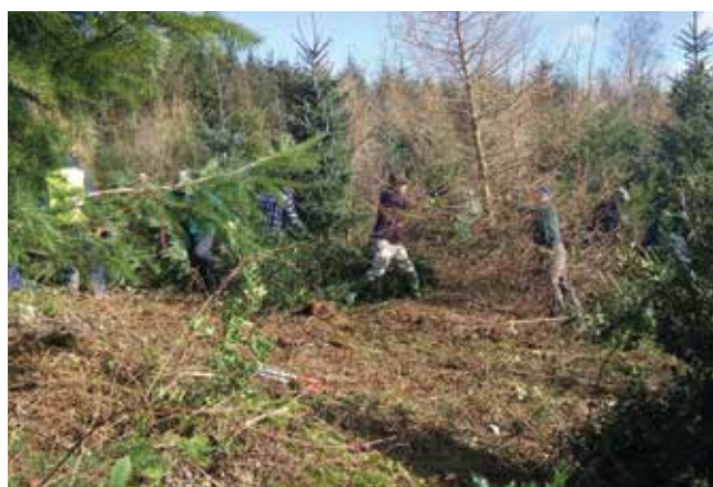
Volunteers clearing scrub from a Scheduled Monument, Hovingham