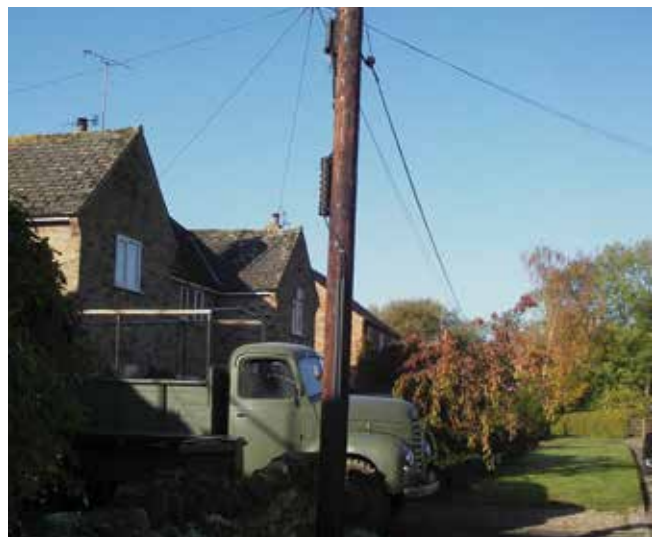
Undergrounding overhead electricity lines, Crambe (after)