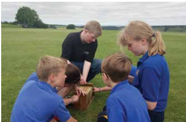
Terrington Hall School Environment Week, led by Yorkshire Wildlife Trust trainees