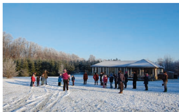
A snowy Junior Ranger Club day at Castle Howard Arboretum