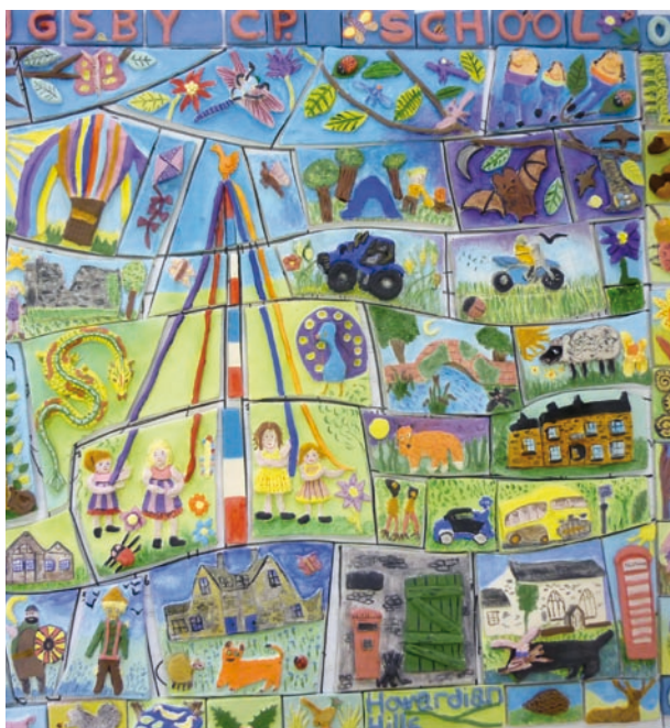
The Slingsby School plaque