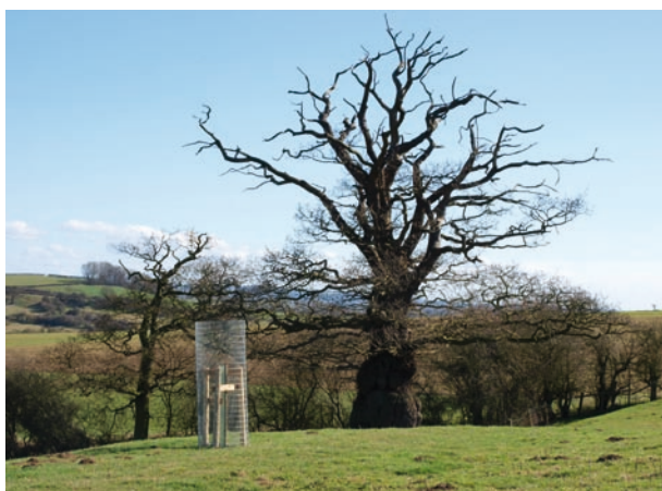
New in-field tree, Stittenham (NYMNP)

In addition to initiating and grant aiding work itself, the AONB Unit also gives advice to applicants and/or comments on applications submitted to the two main national grant schemes: