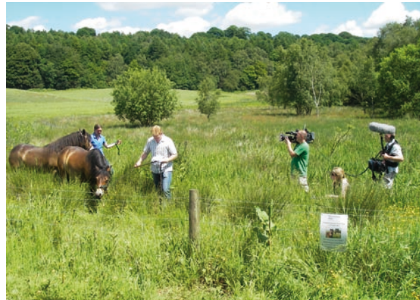
BBC Countryfile filming near Terrington