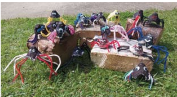
Spiders and bugs made during a Junior Ranger Club day at Husthwaite