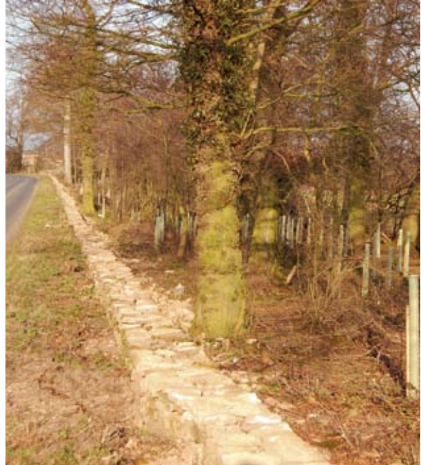
Restored section of Park wall and tree belt, Wiganthorpe