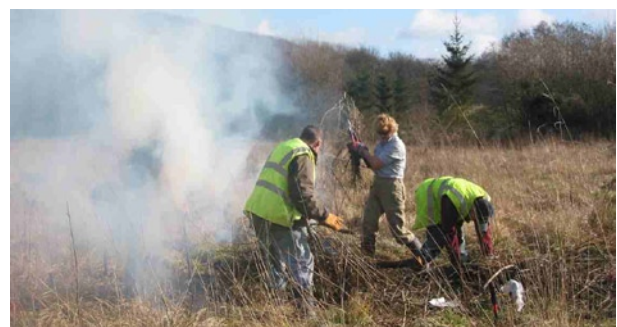
Volunteers controlling willow scrub on a fen site near Crambe