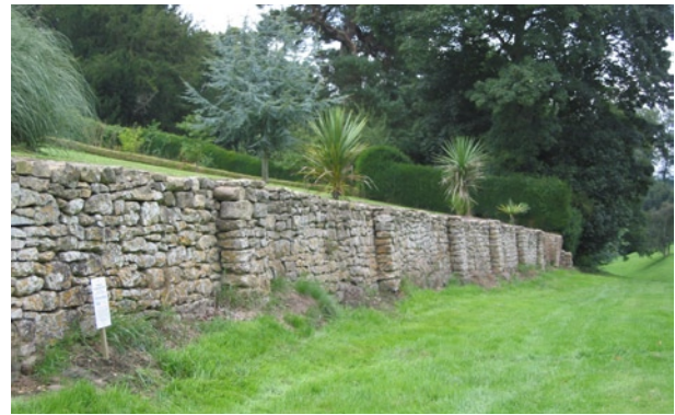
Restored ha-ha wall, Gilling Castle