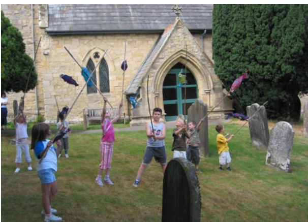
Young Ranger Club day at Ampleforth, making windsock fish

Stories achieving coverage in print, on TV and the radio in 2006/07 included the undergrounding of overhead electricity cables at Terrington, woodland management proposals at Craykeland Wood (Newburgh) and the launch of a Local Information and Walks leaflet based on Hovingham village.