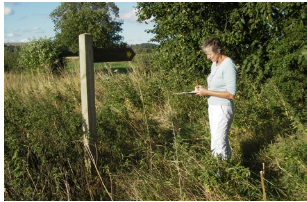
AONB Volunteer surveying Rights of Way condition