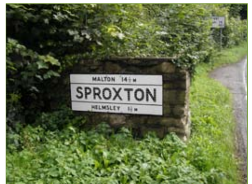
Refurbished village sign, Sproxton (AONB Unit)