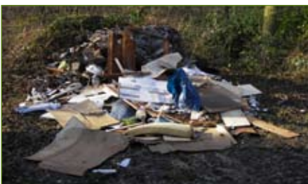
Fly-tipping in the AONB

The Campaign to Protect Rural England (CPRE) is seeking volunteers to help pick up litter near where they live or where they walk frequently. The national campaign is led by our President, Bill Bryson.