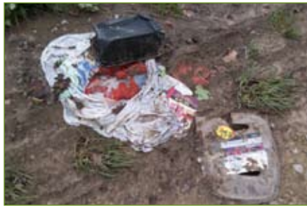
Roadside litter in the AONB (AONB Unit)

If you suspect that someone is breaking the law regarding waste please contact your District Council or the Environment Agency 24 hour hotline (0800 807060).