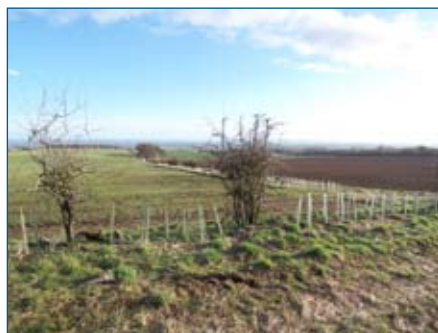
Hedge restoration, Barton-le-Street (AONB Unit)