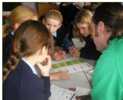
GLOBE – Sustainability Action Plan development with Malton High School (BTCV)