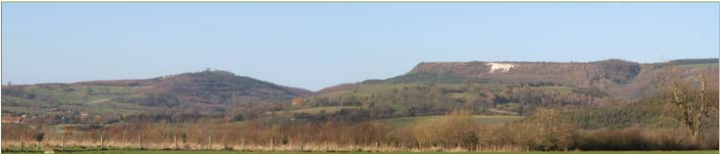
White Horse and Hood Hill

The Lime & Ice Project has now begun thanks to a £500,000 award from the Heritage Lottery Fund and £225,000 from CAN DO partners.