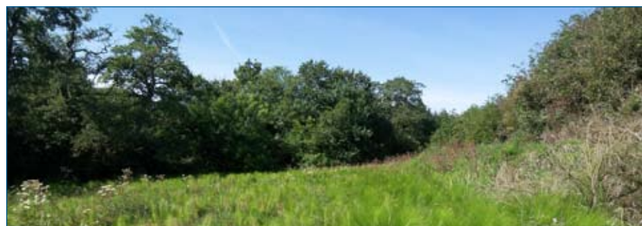
Littledale Site of Importance for Nature Conservation (AONB Unit)

Improvements to the grassland habitats on the slopes will take several years. After only one season's grazing, progress in the fen is already evident. It is envisaged that the site will continue to be grazed in mid/late summer to prevent the build-up of nutrient-rich plant material. Scrub management will also continue and both of these management actions will result in diversification of the flora throughout.