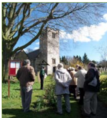
Amotherby Open Churchyard event (AONB Unit)