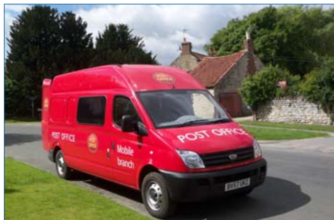
Mobile Post Office in Slingsby (AONB Unit)

Please don't forget to continue to support the village shops that we have in the AONB. Whilst they no longer contain Post Offices they still can provide for many of your day-to-day needs and some have taken the removal of their Post Office as an opportunity to expand their range of goods and services.