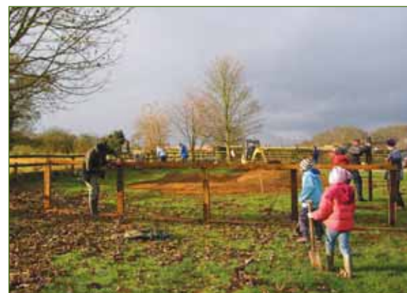
Children and parents working on the new pond and wildlife area at Welburn School.

If you would like further details about the AONB's Sustainable Development Fund or would like to apply for funding for a project, then please contact the AONB Unit.