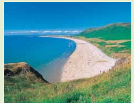
Gower – the first AONB in the UK.

Millions of people, both local residents and visitors, enjoy Areas of Outstanding Natural Beauty every year – many without realising they are in a protected landscape. This year's celebrations will provide the perfect opportunity to discover – or rediscover – what the UK's Areas of Outstanding Natural Beauty have to offer.