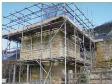
Listed building restoration, Oswaldkirk. (AONB Unit)