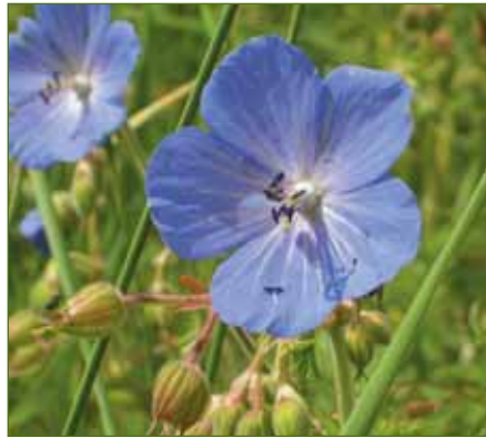
Meadow cranesbill – a typical flower of roadside verges.

Verges are cut either by the County Council (as the Highway Authority) or by the landowner.