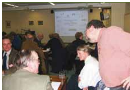
Community consultation event in Helmsley.

A vast range of partners are involved and by working together they are able to pool resources, influence the landscape on a much bigger scale and create an example that others can learn from and hopefully replicate elsewhere.