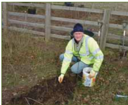
Planting-out the black poplar cuttings. (M. l'Anson)

Cuttings were taken in March by the Thirsk Community Woodland Group, for growing-on in their nursery.