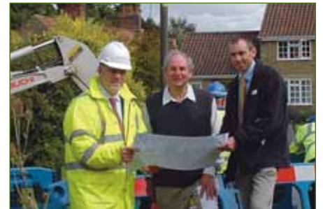
The start of undergrounding work, Terrington. (So-PR)

If you have old but serviceable furniture or white goods that could be re-used, or paper/magazines for re-cycling, then please contact Peter Scott at Basics Plus on (01723) 371335. There is a regular collection service throughout the AONB.