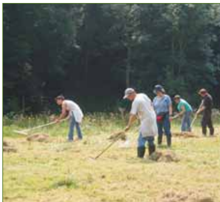
Basics Plus students raking the hay meadow at Fairy Dell SINC.

What have Todd Wood, Scar Wood, Sandlands, Terrington Moor and Wath Beck got in common? They are all places in the AONB that Basics Plus have had the privilege of working on. We've pulled Himalayan balsam, removed tree guards, raked hay meadows, cut down willow scrub and brought the remains of an old mill back to daylight.