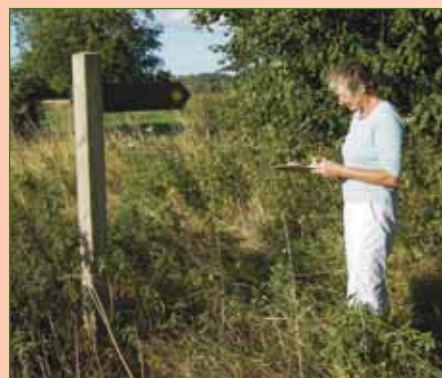
A Howardian Hills volunteer surveying the condition of path furniture.

With such a large network to look after there is always a wide range of tasks to get involved in; anybody interested