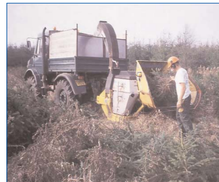
Christmas tree removal to restore unimproved grassland, Crambe.