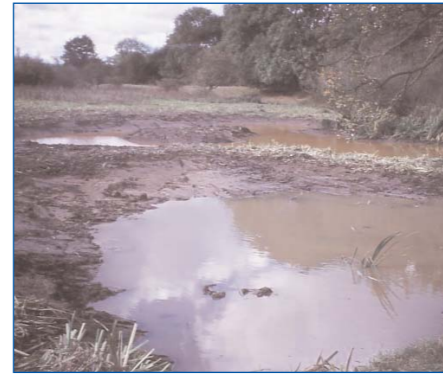
Ox-bow pond restoration, Sproxton.