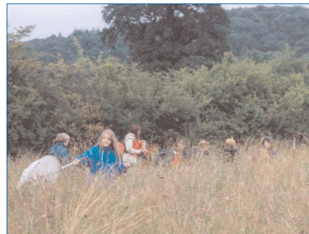
Children on the Discovery Project near Crambe.

The children are using a site near Crambe to put their new skills into practice. The site is gradually being restored from a Christmas tree plantation to unimproved grassland, through an agreement between the landowner and the AONB team. The children will be taking scientific recordings of the vegetation over the next five years, to see how the site develops and how the wildflowers emerge again.