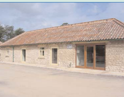
New AONB Office, Hovingham.