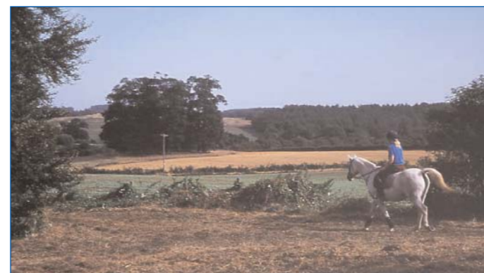
"Natural Beauty And Tranquillity", Welburn.

A living and working landscape - The Howardian Hills is a traditional lowland agricultural area, depending heavily upon farming and forestry. Whilst diversification of farm and Estate enterprises is necessary in order to maintain incomes, the continuation of a 'traditional' agricultural infrastructure is considered to be critical to maintaining the social and environmental character of the area.