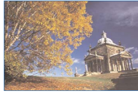
The Howardian Hills AONB - designated in 1987.

Local communities - Issues of major concern to local communities include speeding traffic, affordable housing, village services and isolation. Despite being the main responsibility of other agencies, and therefore outside the direct influence of the AONB Committee, the Management Plan does however contain objectives to help tackle these issues wherever possible, linked by the theme of sustainable rural development.