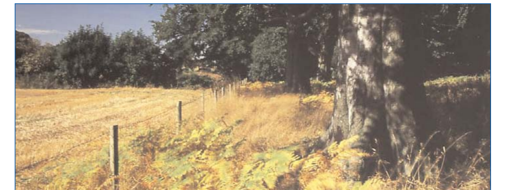
Autumn colours, Terrington Moor.

NOTE: The new AONB Management Plan can be used by farmers and landowners to identify important sites on their land, which could be entered into one of these schemes. Further advice is available from the AONB Unit on (01653) 627164.