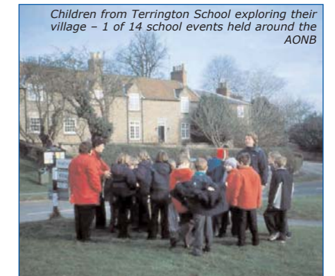
Children from Terrington School exploring their village - 1 of 14 school events held around the AONB

The final plan will be produced and presented to the AONB Joint Advisory Committee (JAC) for their approval in February 2004. The three local authorities (North Yorkshire, Ryedale and Hambleton) will then need to formally adopt the new Management Plan by 1st April 2004. This is a requirement placed on them by the Countryside and Rights of Way (CROW) Act. The Management