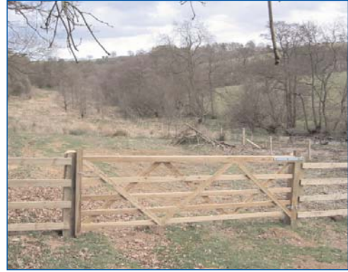
New fencing around a SINC at Coulton