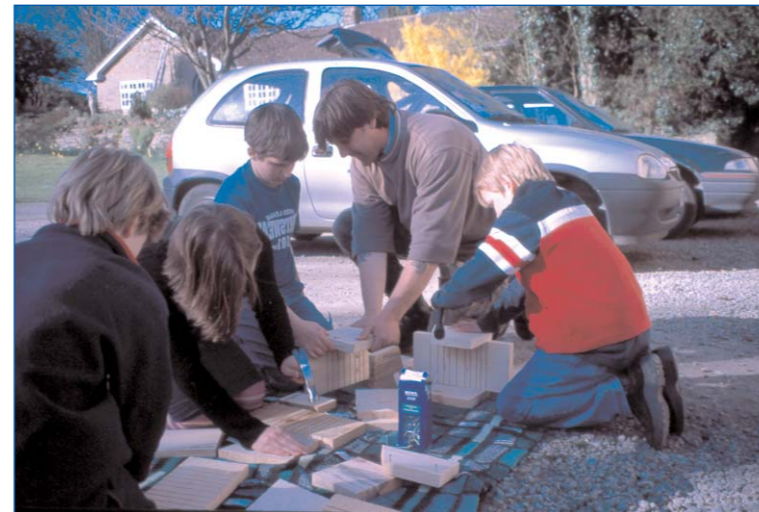
Bat and bird box making at Bulmer

All box-builders were given details of where to erect the box and how to maintain it.