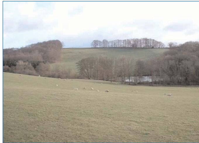
Dale Wood, Bransby; Winter 2002/2003.