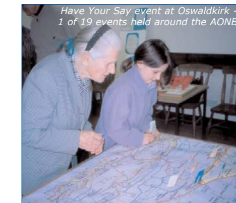
Have Your Say event at Oswaldkirk - 1 of 19 events held around the AONB

This year the work of the AONB Unit has been dominated by the production of the new Management Plan, which will be published in the summer of 2004. This document will contain principles and objectives to help protect and enhance the area over the next 5 years and beyond.