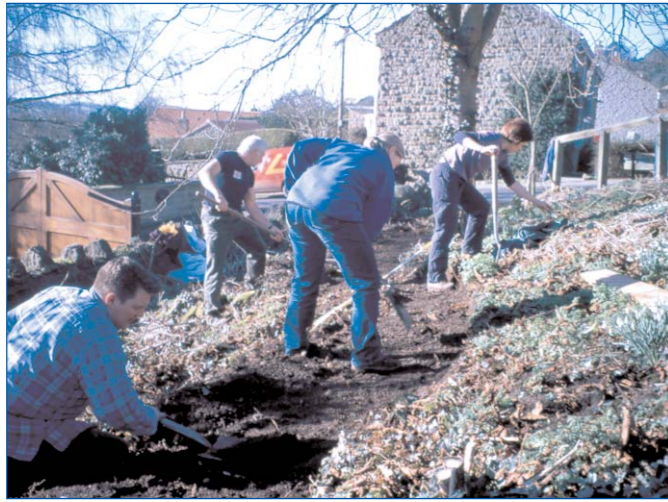
Creating the path at Chestnut Bank

Villagers from Oswaldkirk joined forces with the AONB Unit and the British Trust for Conservation Volunteers (BTCV) to help enhance an important village space. Chestnut Bank in the centre of the village was in need of some care and attention. The first stage was the clearance of invasive weed species such as elder and brambles, then a new path was laid and some additional trees planted. The village has recently commissioned a new bench, which has been placed next to the site.