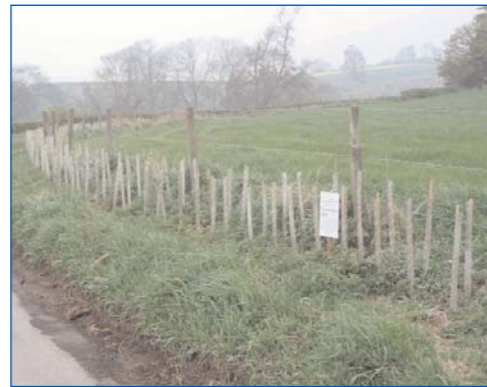
New hedge, Oulston